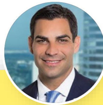
Francis X. Suarez