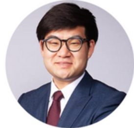
Sam Cho Commissioner Port of Seattle