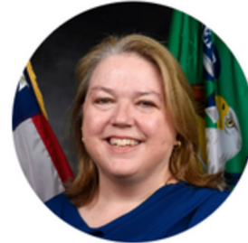
Laurel Blatchford Chief Implementation Officer, IRA United States Department of the Treasury