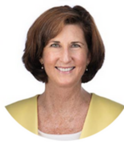
Lynne Robinson Mayor City of Bellevue