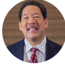
Bruce Harrell Mayor Seattle